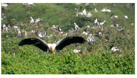
Vedanthangal Bird Sanctuary